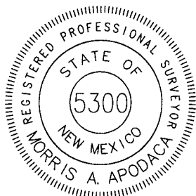
Exhibit A, Page 1 of 1

CONTAINING AN AREA OF 2.453 ACRES. MORE OR LESS.